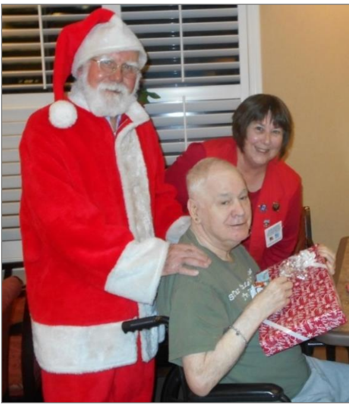
The Annual Holiday Party hosted by the VFW was enjoyed by all. The residents enjoyed the visit with Santa, Santa's helpers, and one of the Cootie Commanders. The residents enjoyed the holiday costumes.