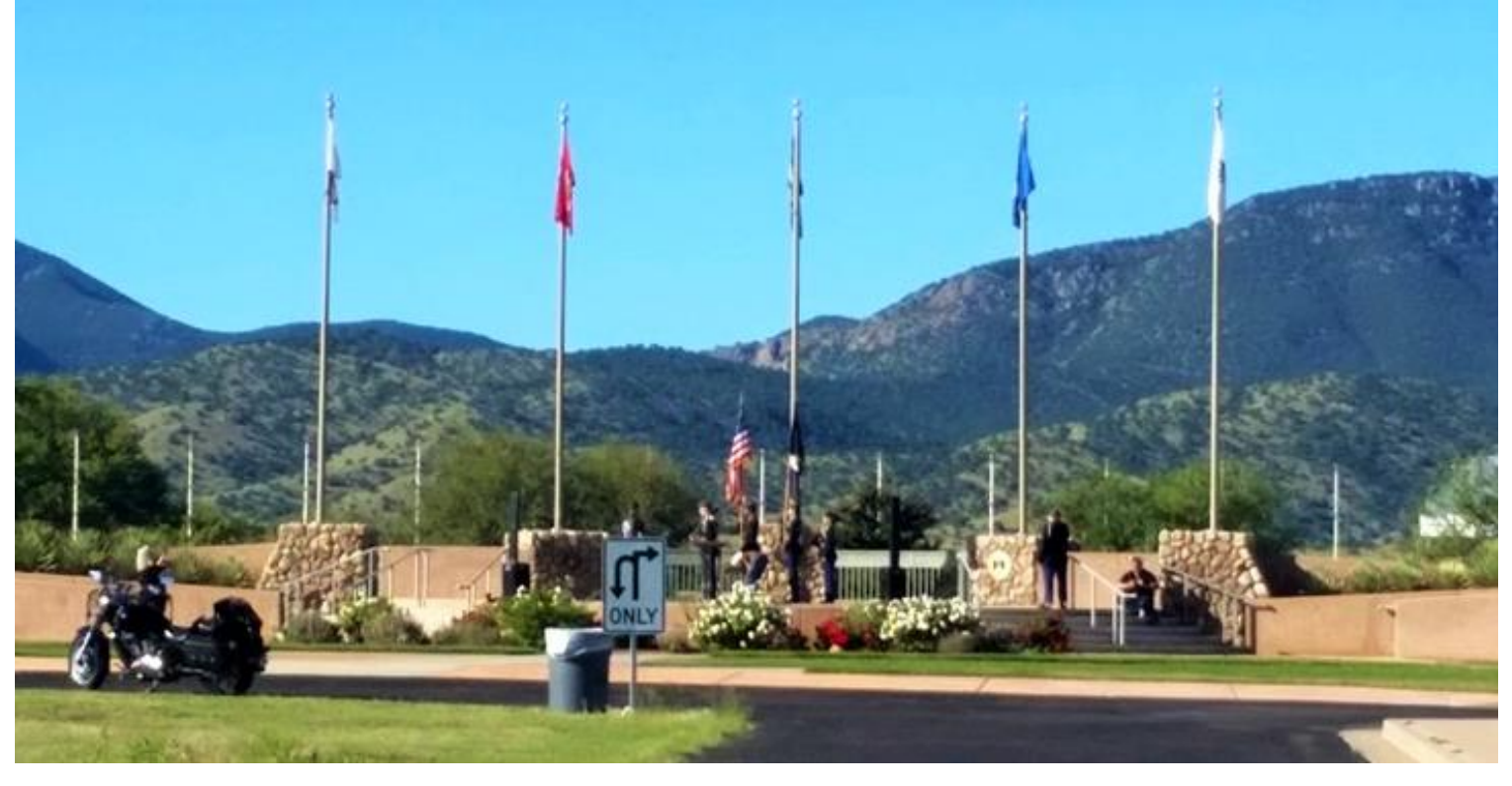
September 17th the local Girl Scout troop retired over 250 US flags at SAVMC.

September 17th The Veterans of Foreign Wars Riders Skyland Chapter conduct their annual POW/MIA observance ceremony at the Southern Arizona Veterans Memorial Cemetery.