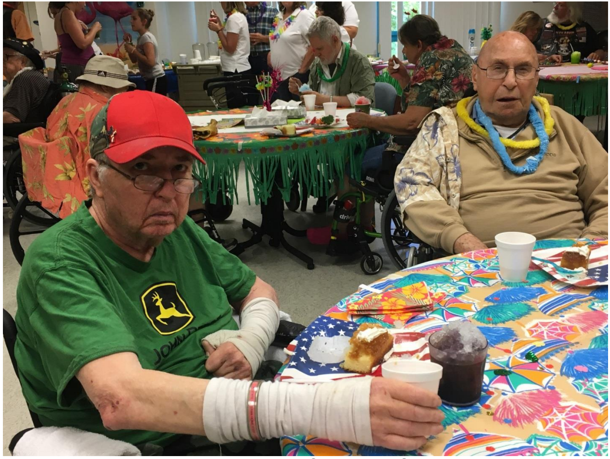
Luau Party with Riders USA and Blue Star Moms