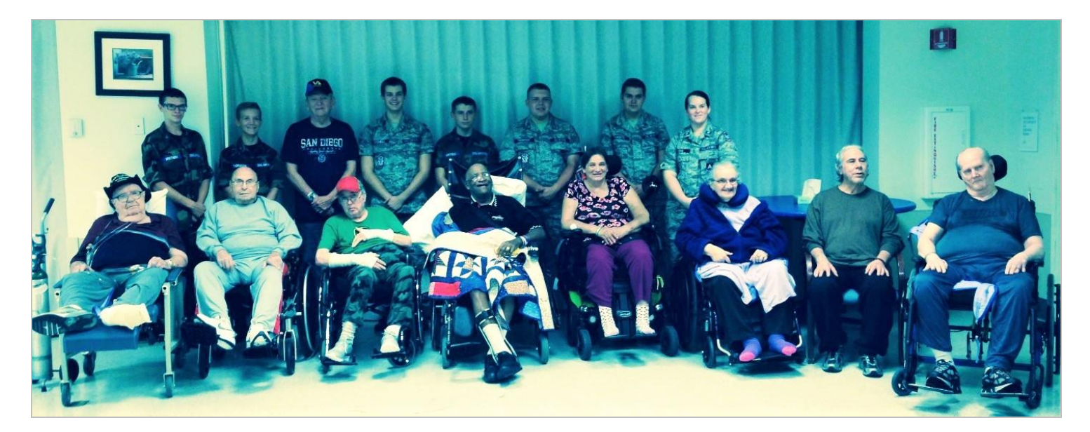
Balloon Volleyball with Civil Air Corp 388 Composition Squadron