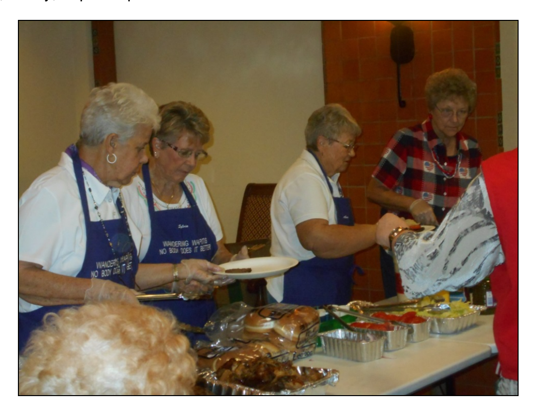
Sierra Vista Elk Wandering Wapitis serving up the BBQ fare.

Our 4th of July BBQ hosted by the Elks was attended by record numbers – more than 75 residents and family members were served. They enjoyed ribs, hamburgers, hot dogs, potato salad, baked beans, and a choice of apple, cherry, or peach pie and an assortment of soft drinks.