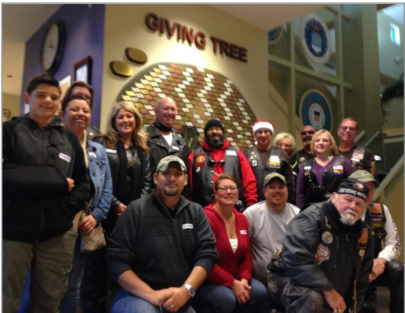
Above, American Legion Riders, Post 61

At left, American Legion Post 81 Juniors